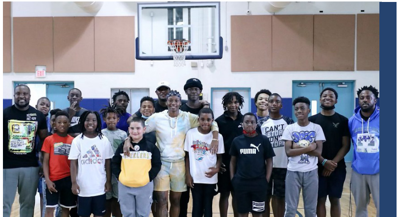
WNBA Player Erica Wheeler