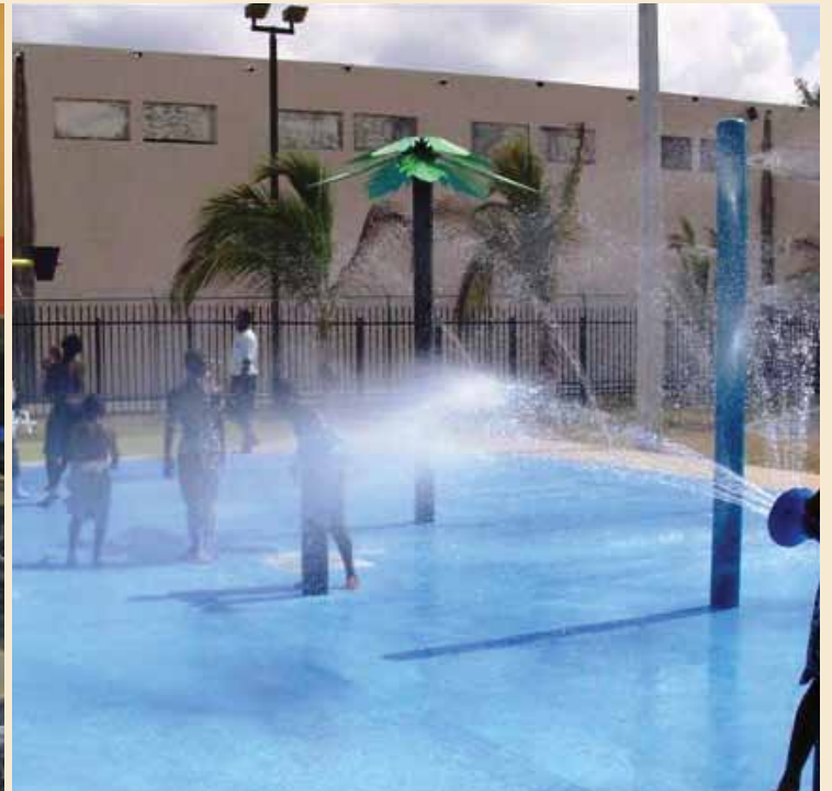
NFL YET Aquatic Park