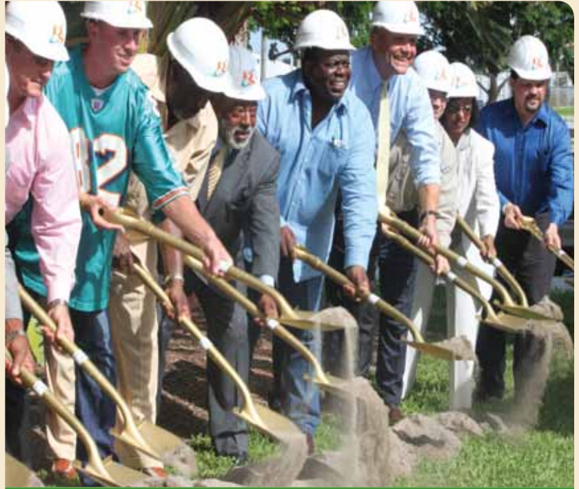
NFL YET Addition Groundbreaking-June 23, 2010