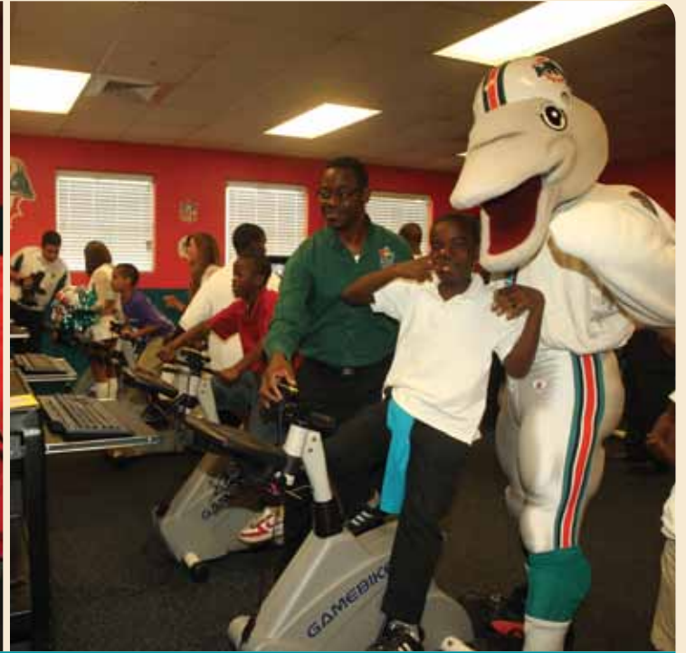
Dolphins Indoor Virtual Fitness Center