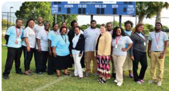
Communities In Schools of Miami