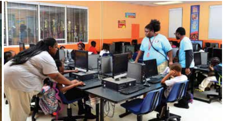
After School Programs