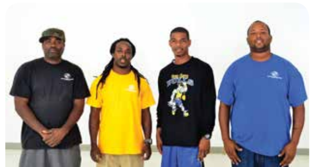
Boys and Girls Clubs of Miami-Dade