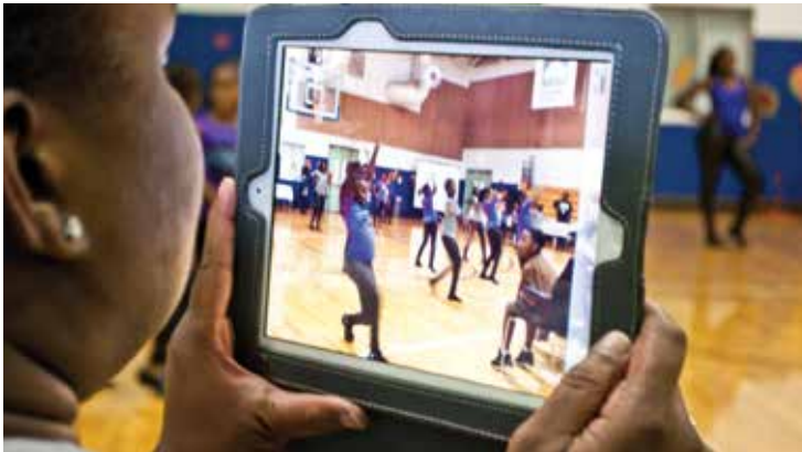
Access to Technology