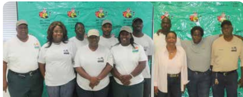
Miami-Dade County Parks, Recreation and Open Spaces Department